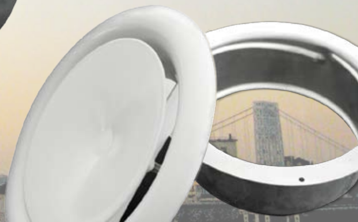
Type : E