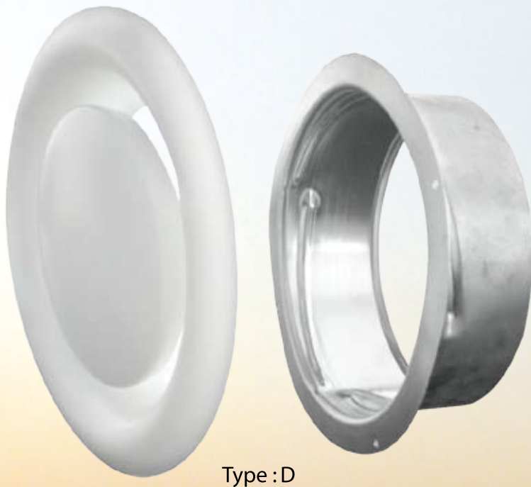
Type : D